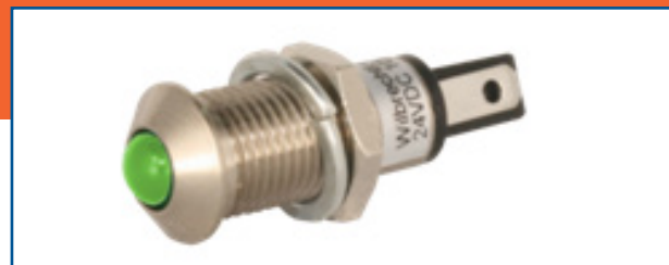
5mm Panel Mount LED Assemblies