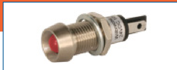
5mm Panel Mount LED Assemblies