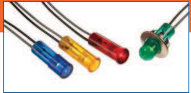
5mm Panel Mount LED Assemblies