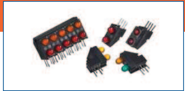
3mm PC Board Mount LEDs