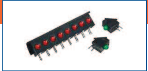
3mm PC Board Mount LEDs